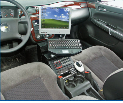
Stout Mount™ Console Versatile design allows for endless equipment configurations. Innovative swing-arm keyboard mounting. C-SM-830